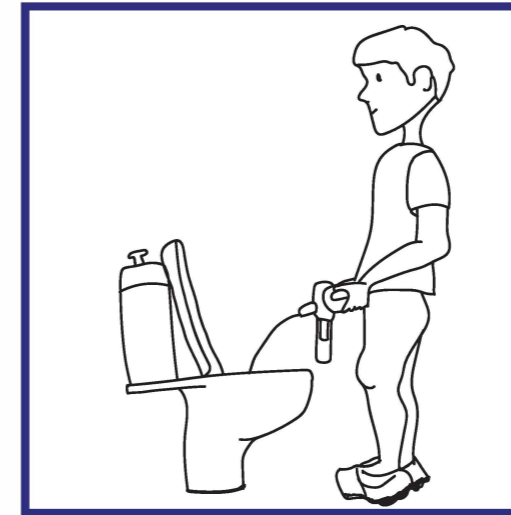
Step 4: Point the spout towards the toilet and begin urinating into the funnel.