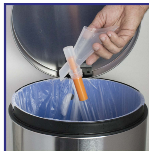
Step 8: Dispose of the funnel.