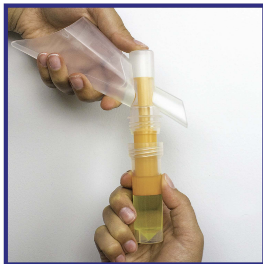
Step 6: Unscrew funnel from tube (keep tube upright to prevent spilling the urine sample).