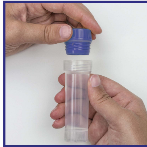
Step 2: Unscrew tube cap.