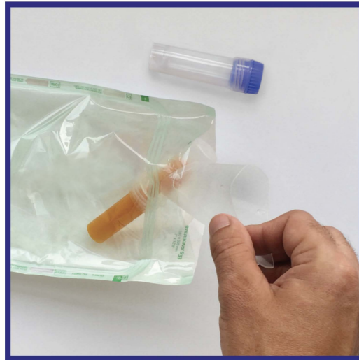
Step 1: Remove funnel and tube from urine transport kit.