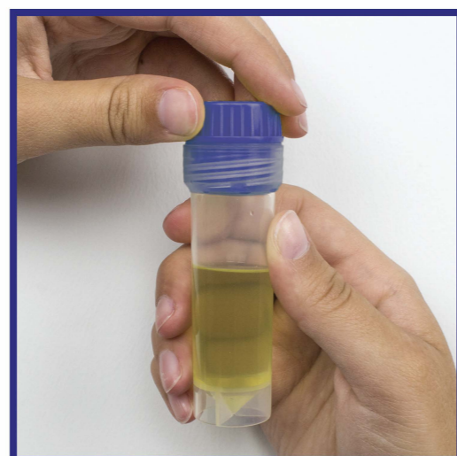
Step 7: Firmly screw cap onto the tube (keep tube upright to prevent spilling the liquid preservative).