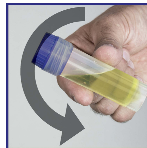
Step 9: Gently invert UrNCollect Tube five times to mix the contents.