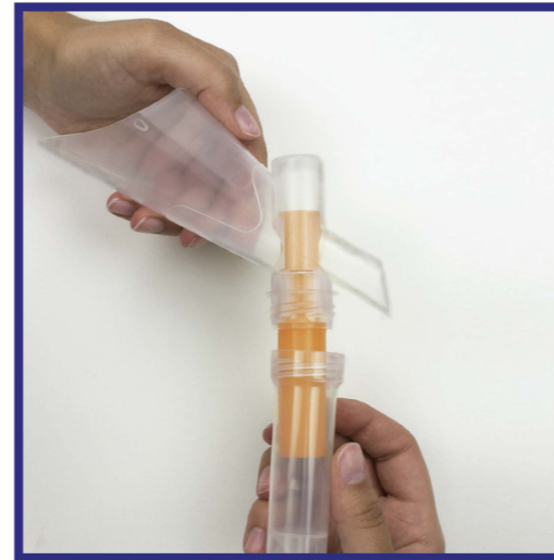
Step 3: Firmly screw funnel onto tube (keep tube upright to prevent spilling the liquid preservative).